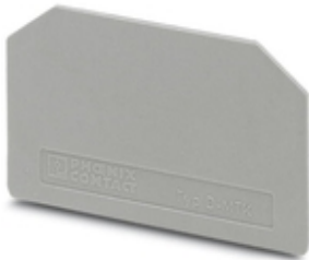
End cover, length: 46 mm, width: 1 mm, height: 28.7 mm, color: gray

Please be informed that the data shown in this PDF Document is generated from our Online Catalog. Please find the complete data in the user's documentation. Our General Terms of Use for Downloads are valid ( http://phoenixcontact.com/download )